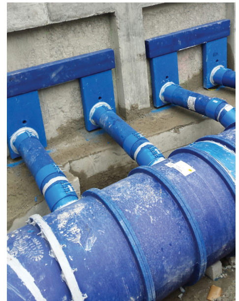
Installation of the The BlueDuct preinsulated Duct System at the Roberta A. Smith Library

The underground duct installation started with digging the trenches. Getting the elevations correct was critical to this project because The BlueDuct® penetrates the foundation wall in two locations. During elevation work, Vishal Sookhai, field-training specialist from AQC Industries arrived at the job site. The weather on the first day was rainy and around 40 degrees Fahrenheit. The temperatures on the second day were in the high 50-degree Fahrenheit range.